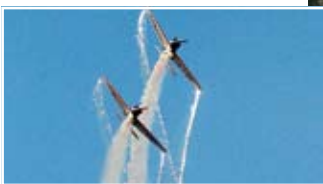
Above Twilight aerobatics and firework display